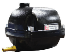
RTi-MGD Mini MAG

Tank Drain Combination Automatic Float & Manual Petcock Drain