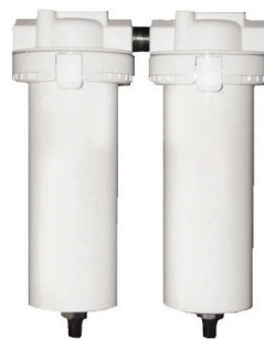
*Units shown with indicator

For higher pressure applications, consult factory. Units equipped with differential pressure indicator have max. temperature and pressure of 125 °F and 150 PSIG, regardless of bowl material.