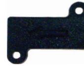
N32-95-020 Blanking cap (To replace indicator)