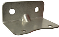
BK-1 60 SCFM Only Wall Mounted (Combo units require two)

Example 3P-020-M02-Fi mounted with N34-95-969