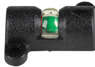
N32-W1-DPI Differential pressure indicator (used on most models 1/4" - 2" NPT)