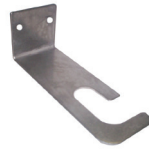
PB-004 1/2" Models Only Supports units on pipe (Units can still rotate)