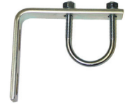
N32-95-734 1/4" - 1" units 1/4" x 1/2" slots on 1 1/2" centers (universal)